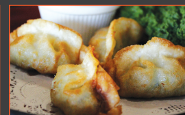
GYOZA (Steam or Fried)